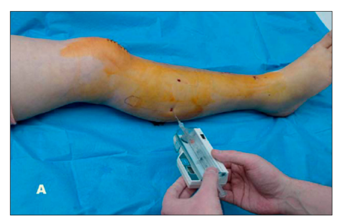
Figure 2. ICP measurement. Lateral compartment [26]

Compartment pressure monitoring. The most useful method in the diagnosis of ACS with which it is possible to obtain the value of the ICP parameter, which determines the correct diagnosis and the necessity for urgent surgical intervention. There are many devices for ICP monitoring, from traditional methods (Whiteside's technique needle manometry) to the use of dedicated ICP monitors with a pressure transducer. In the method described by Whiteside, a needle is inserted into the muscle compartment and saline injected. The air resistance it must overcome is read as pressure by a mercury manometer connected through a tube to the needle [24]. Modern ICP measuring devices are also based during the injection of saline into the muscle compartment, and the pressure is read on the device's screen (Stryker ICP monitoring system) (Fig. 2). The threshold for ACS is considered to be an ICP > 30mmHg. Today, the more commonly used parameter is delta pressure ( \Delta P ), calculated from the formula: diastolic blood pressure - ICP. A value of \Delta P < 30 mmHg is considered the borderline of urgent surgical intervention. The importance of measuring ICP in any compartment, not just the anterior compartment (burdened with the highest probability of ACS), is further emphasized [25].