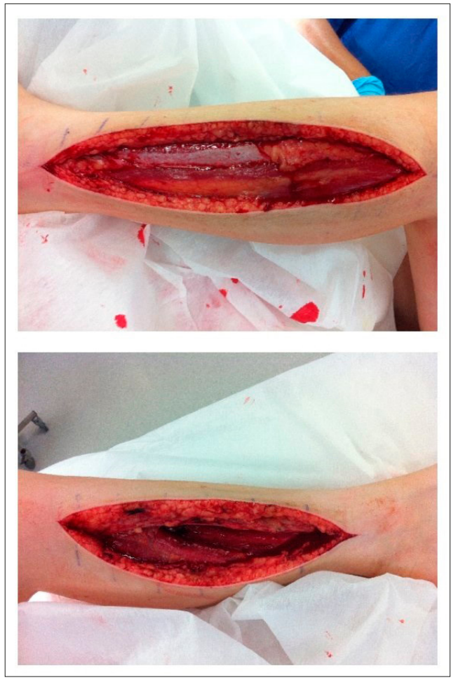
Figure 3. Fasciotomy of the left lower extremity. Upper image – lateral incision, lower image – medial incision [30]

Complications of ACS and fasciotomy. Complications after fasciotomy are common (up to 1/3 of patients), and include wound infection, suture separation, soft tissue necrosis, osteomyelitis or blood vessel damage [25,29]. The timing for closing an incision and debridement at the surgery are equally important factors in reducing complications after fasciotomy. It has been described that patients with a wound uncovered up to 4 days after fasciotomy were reported to develop infection at a lower rate than patients with a wound uncovered more than 7 days after surgery. Also in open fractures, early closure and limiting the amount of time the bone is uncovered helps to decrease the incidence of wound infection and osteomyelitis [46]. Rhabdomyolysis can develop secondary to ACS in about 40% of patients, leading to renal failure. If untreated, ACS can lead to more severe conditions. Limb amputation appears to be by far the worst complication and occurs in about 10% of ACS patients [31-33], and usually develops on the irreversible tissue loss and infection. In order to recover, patients must undergo difficult and long-term rehabilitation [40]. Another consequence of untreated ACS can be Volkmann's ischemic contracture. This is a relatively rare condition, most often occurring after upper extremity injuries. Muscle ischemia is caused by arterial embolism or specifically ACS (the most common cause of Volkmann's